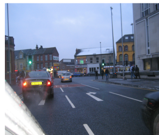
Clarendon Road towards junction with Woodhouse Lane