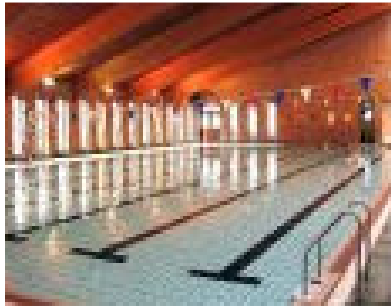
Swimming pool at Kirkstall Leisure Centre