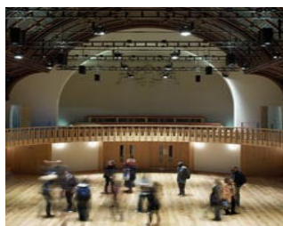
Howard Assembly Rooms

The Board visited the Grand Theatre and Howard Assembly Rooms which have been refurbished to an extremely high standard. The Assembly rooms have created a permanent home for Opera North.