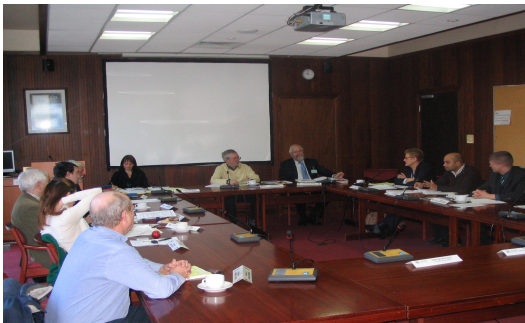
Scrutiny Board City Development

"I think the methodology for introducing a Traffic Regulation Order especially RPZ's, is very frustrating. So much time is given over to dealing with objectors and addressing or disproving their concerns"