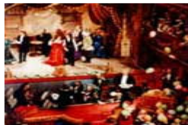
Inside the City Varieties

We had wanted to visit the Mansion, but as works will not be completed in this municipal year, the next Board will receive the invitation.