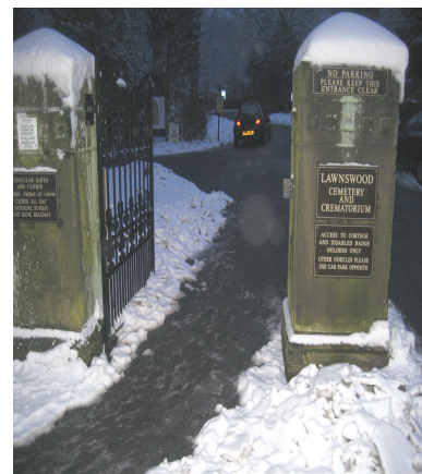
Entrance to Lawnswood Cemetery & Crematoria

However, we were concerned that this decision had been implemented on 10 th October 2008 prior to the expiry of the Call-In period on the 17 th October 2008 and asked that effective measures be put in place to avoid this happening again.