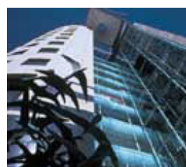
Tower block in the city

In September 2008 we received a presentation and gave our views and input to the development of the city's agenda for improved economic performance.