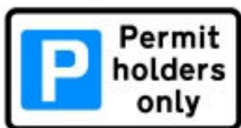
Residents' Parking Zone Sign

(d) In order to improve the clarity and transparency of the process