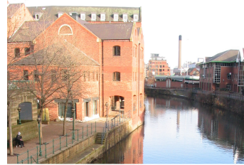
From the bridge, Neville Street

We were advised and commented upon the consultation exercise that was being carried out on the draft vision for leisure centres in Leeds prior to recommendations being presented to the Executive Board.