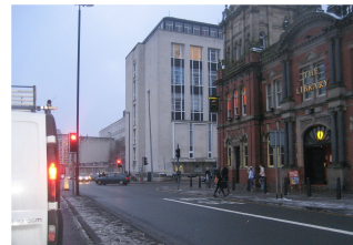
Woodhouse Lane towards junction of Clarendon Road

(d) ensure that early consultation is carried out in respect to options for making early improvements to the A660 and that this shows the overarching strategy for the corridor to ensure that schemes are not considered in isolation.