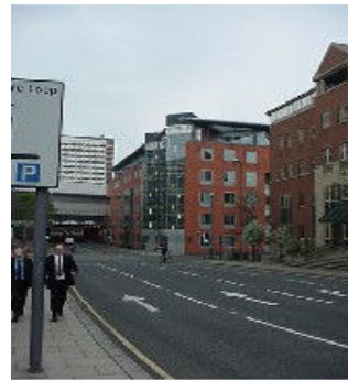
To Sovereign Street car park

We agreed that this was an exciting proposal with a longer term objective of exploring land assembly opportunities in partnership with landowners of major sites that would function as a new park for the City Centre.