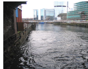
Dark Arches, Granary Wharfe

We heard from the Chief Highways Officer and a representative from the Environment Agency on the latest version of the Leeds Flood Alleviation Scheme Design, Vision and Guide which aims to minimise the potential detrimental impact of the scheme and maximise the opportunities along 19km of the river Aire.