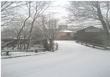
Entrance to St Ann's Mill

We concluded that the factors raised by the signatories of the Call-In would not have made a material difference to the Executive Board's decision and the decision was immediately released for implementation.