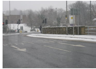
Savins Mill Way

We decided on the evidence presented to release this decision for implementation.